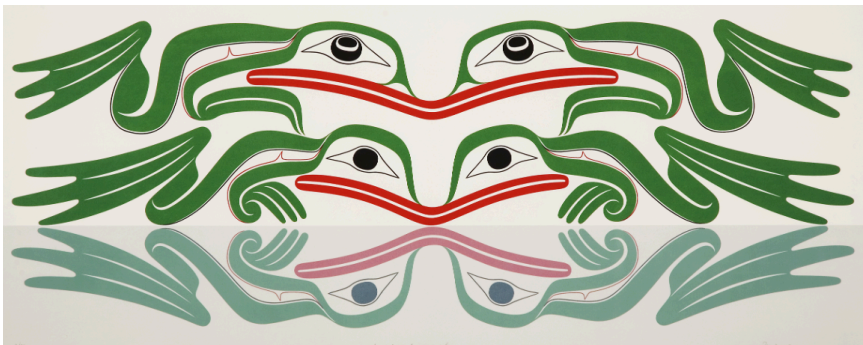
Looking Back at Where We Came From, 2000